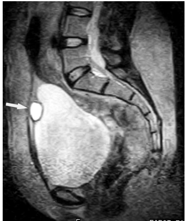
Figure 3. T1W axial MRI scan shows an isointense mass at the anterior of the urinary bladder (arrow) (a). Sagittal T2W MRI revealed a hyperintense mass between the abdominal wall and urinary bladder (arrow). There was not any communication between urinary bladder and abdominal wall (b).