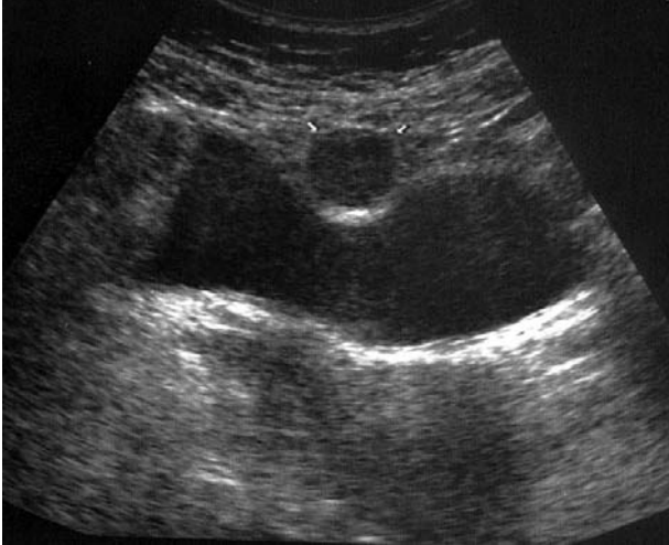
Figure 1. Transabdominal sonography shows an anechoic, thin walled cystic mass between the abdominal wall and urinary bladder (small arrows).

The patient had surgery after the diagnosis. Pathology report was compatible with acut appendicit and urachal cyst.