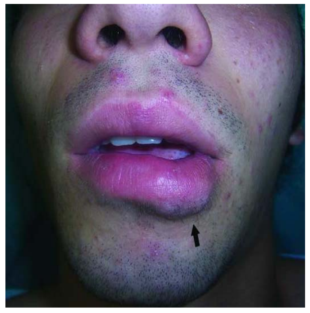
Figure 1. 1,8 x 1,1 cm mass located at the inferior border of the lower lip.