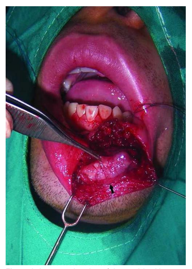
Figure 2. Intraoperative view of the grayish white mass with well defined capsule.